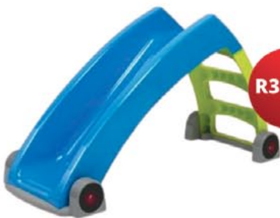
CAR SLIDE ASSORTED COLOURS