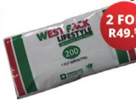
WEST PACK SERVIETTES 300x300 200's sc112055