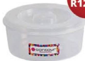
BISCUIT BARREL sc110694