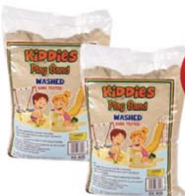
KIDDIES PLAY SAND 20kg sc29452