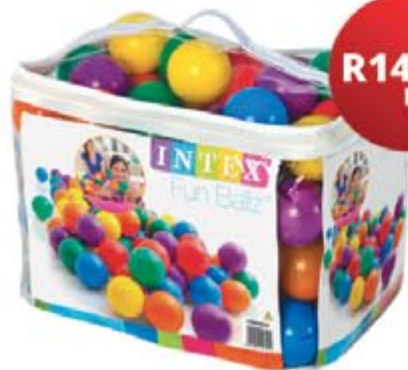
FUN BALLS 100pc