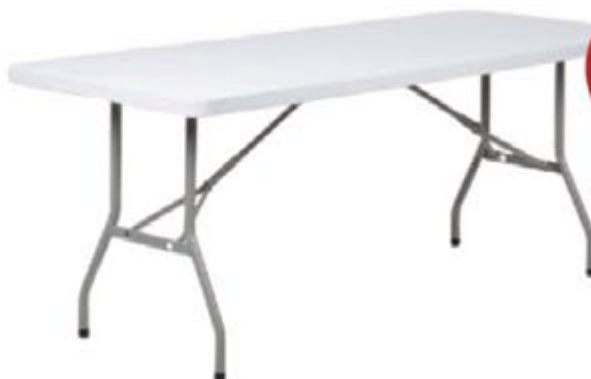
FOLDING PLASTIC TABLE 1860mm x 760mm sc29894