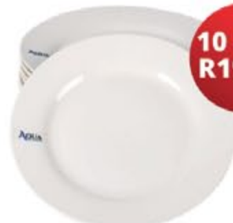
SUPER WHITE DINNER PLATE sc75537