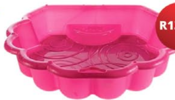
SHELL SAND PIT ASSORTED COLOURS