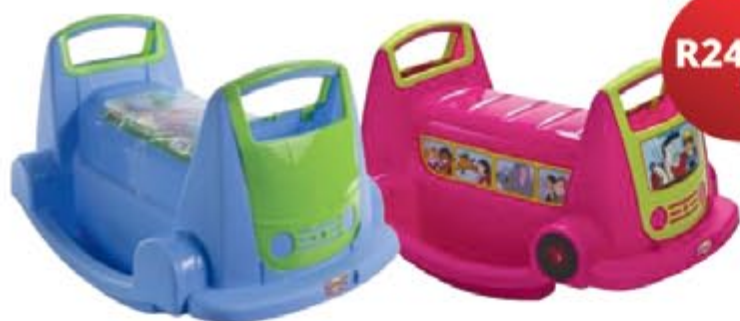
SUNNY BUS ROCKER ASSORTED COLOURS

VALID UNTIL 31 DECEMBER 2020 - WEST PACK EXPRESS GROBLERSDAL