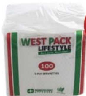
WEST PACK SERVIETTES 300x300 100's sc111364