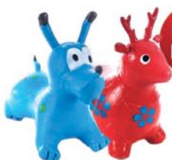
INFLATABLE BOUNCY DOG/DEER DEER R89.90 | DOG or UNICORN R99.90