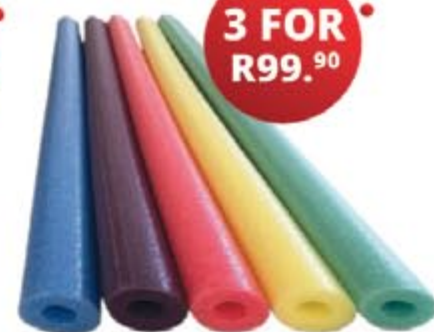
POOL NOODLE sc76484