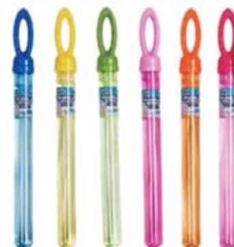
BUBBLE WAND R14.90 EACH sc96830